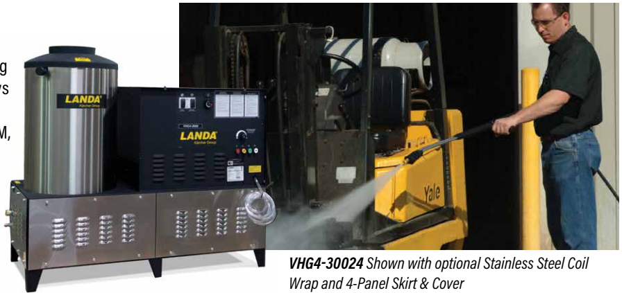
VHG4-30024 Shown with optional Stainless Steel Coil Wrap and 4-Panel Skirt & Cover

Compact but heavy duty, this natural gas model's footprint is a mere 24" x 53" for the smallest unit, making it an ideal choice for congested work areas or wash bays where space is at a premium. The small size makes it no less efficient; with cleaning power up to 3000 PSI and 8 GPM, this machine delivers enough cleaning action to tackle a variety of challenges, and includes an optional wireless remote control. The VHG is especially adept at cleaning and maintaining the appearance of the dirtiest fleet or construction equipment.